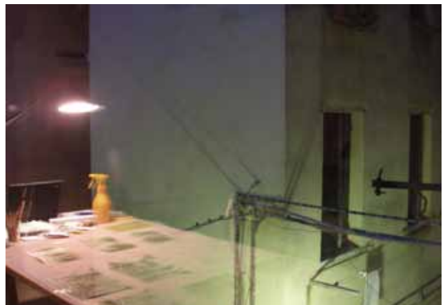
Series Corte Ca' Michiel: My reflected work table at night