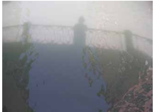
Upper left: „On my balcony at Corte Ca' Michiel“